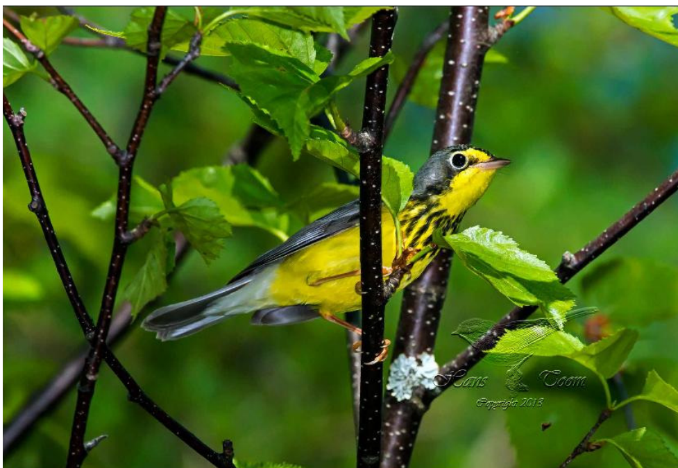
Lewis Lake Warbler Walkers 2013